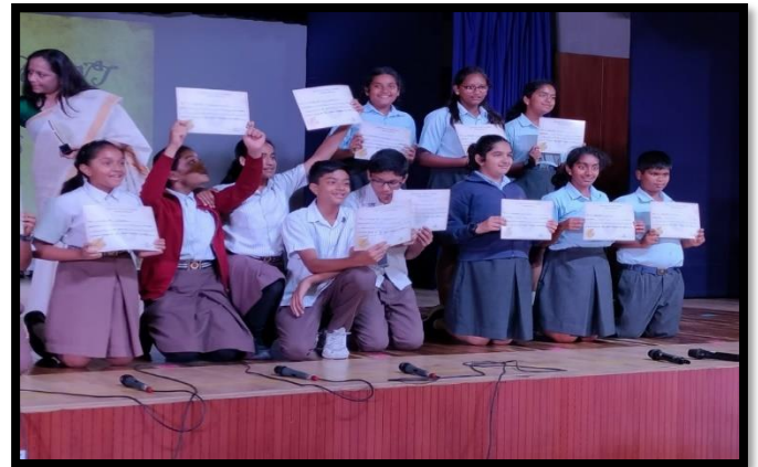
Our brilliant stars made us proud by bagging the third position in the Kannada skit in 'SoUlit' organised by NPS-KRM.