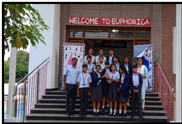
NAFLites won the second position in Group Singing-Junior Category at 'Euphorica-Musical' Fest, organised by NPSI-Mysore