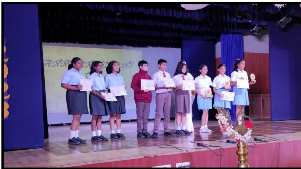
Our students brought home laurels by adding another feather in the NAFL-N cap. They won the third position in the English Verse Play in 'SoUlit' organised by NPS-KRM.